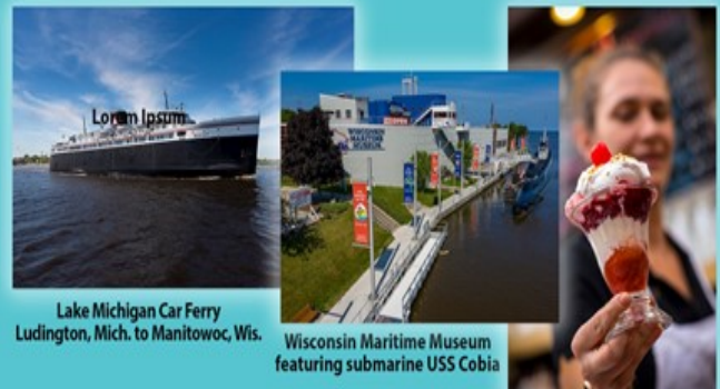
Lake Michigan Car Ferry Ludington, Mich. to Manitowoc, Wis.

Northeast Wisconsin is a beautiful place in late summer - and the Wisconsin Region Studebaker Drivers Club will have a wide range of great activities planned for the 59th SDC International Meet. Stay tuned for more details! We'll see you there!