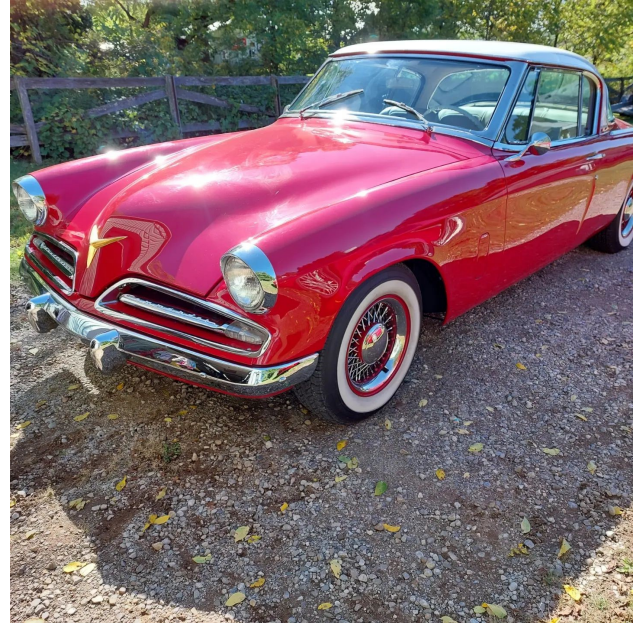
Read about this beauty on the cover of the November Turning Wheels.