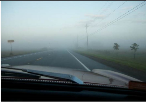
A pretty foggy start to the day

This year saw the return of the "Cars in the Park" at Ruthven Castle in Cayuga. This is a National Historic Site that was built in the early 1800's of sandstone brought across Lake Erie from Ohio. There was a fantastic showing of cars, lots of prizes and it was a great day.