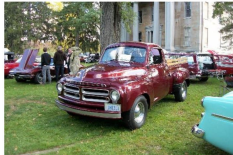
Jim Cumisky's 1955 Pickup