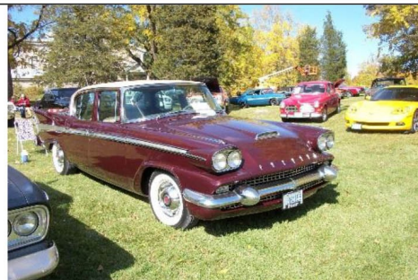
A 1958 Packard Owner unknown.