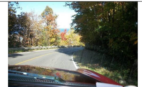
Heading home down the escarpment a great day at Ruthven.