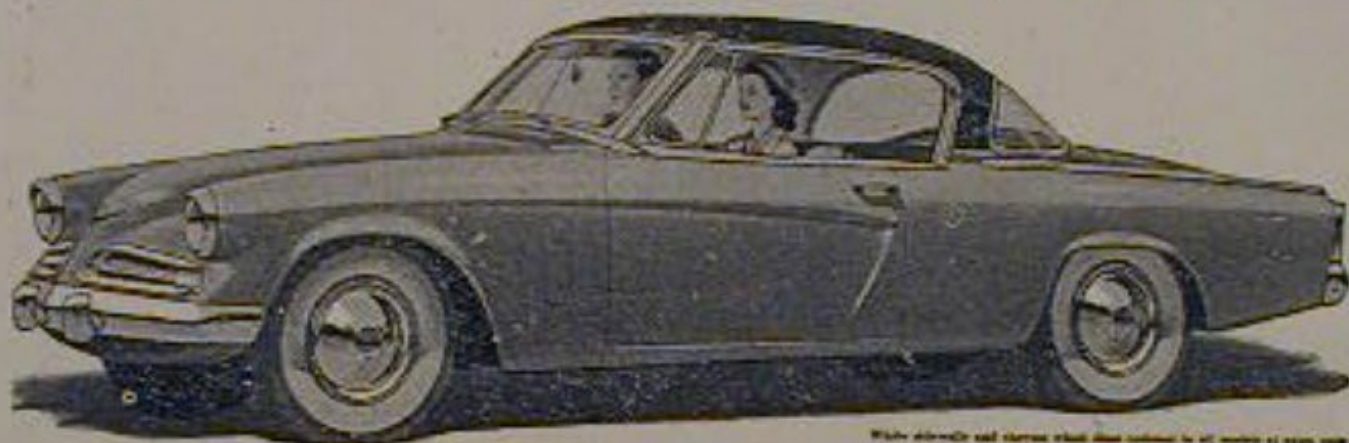
Wide wheelbase and chassis stand alone evidence to all motorists of great value