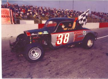
Roly Racing in the Hobby Class at Flamboro Speedway