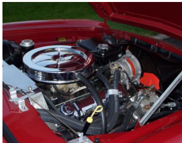
The Engine Compartment