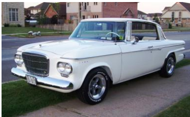
1962 Daytona Hardtop