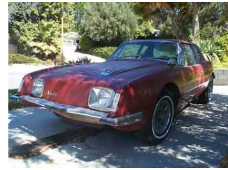
The Avanti in the Fall 2001 in California