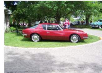
The Avanti at the Plunkett Show 2010