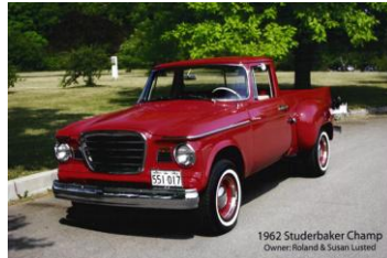
1962 Studebaker Pickup