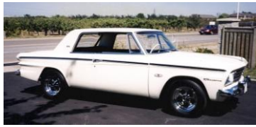
1964 Daytona Superlark Clone